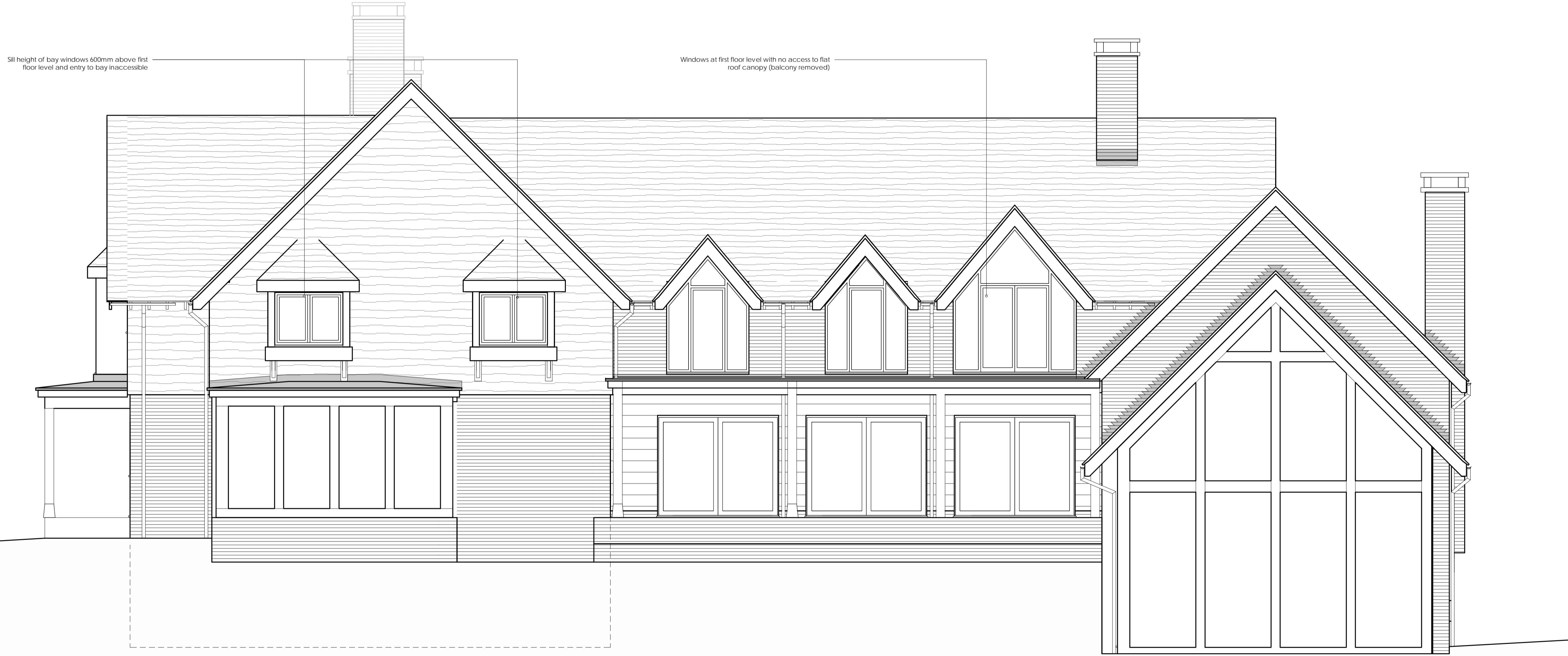
NORTH ELEVATION 1 : 50

A 24/06/16 Changes following consultation with VOWH revision date description status