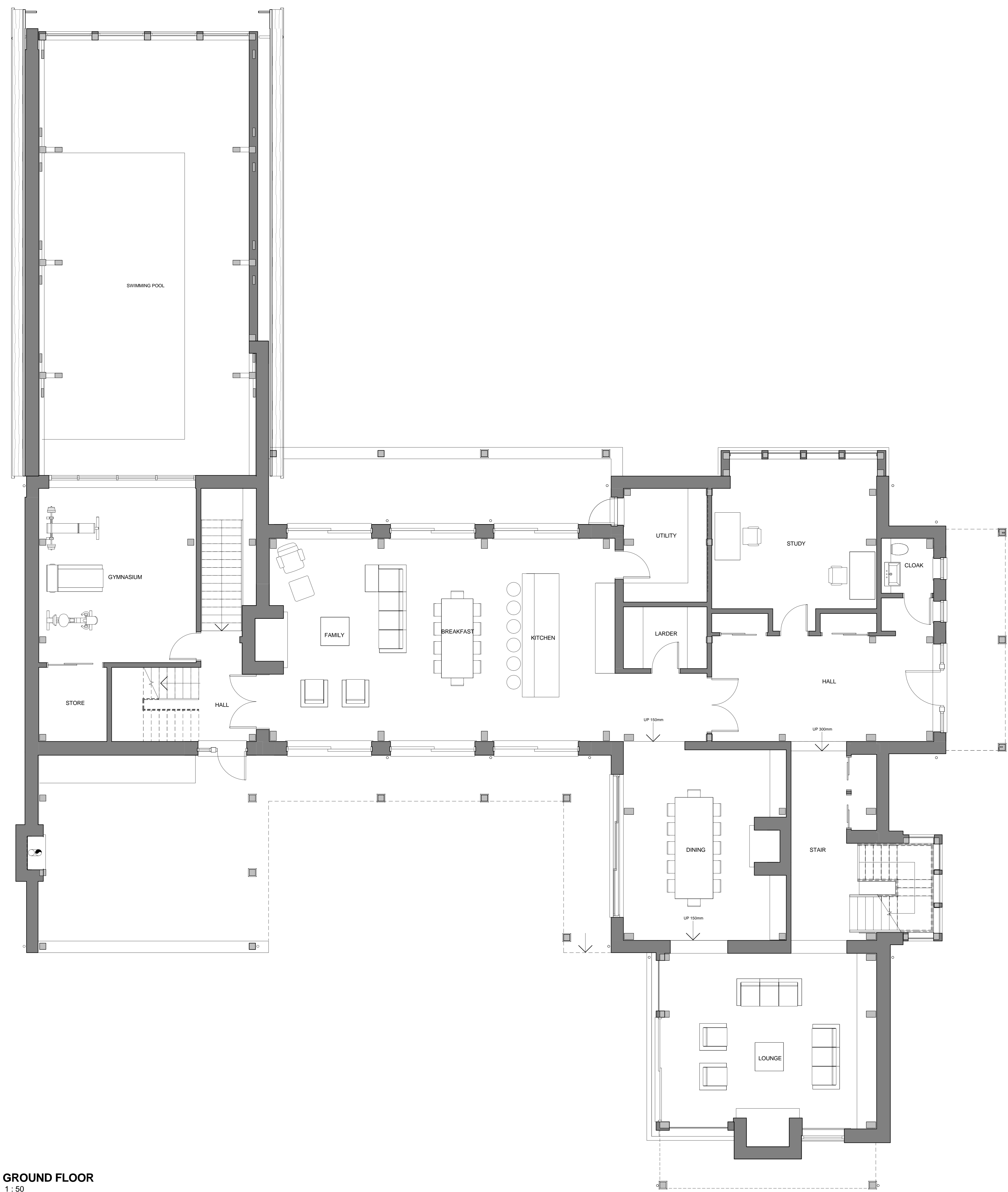
GROUND FLOOR 1 : 50

A 24/06/16 Changes following consultation with VOWH revision date description PRELIMINARY THE GATEHOUSE READING ROAD, UPTON GROUND FLOOR PLAN MR K NAYLON 19/07/16 JC 1:50 @ A0 14073 - PP0231 - A The Studio, 70 Church Street, Warwick, Oxford, OX3 3JZ 01827 878961 | info@andersonorr.com | www.andersonorr.com